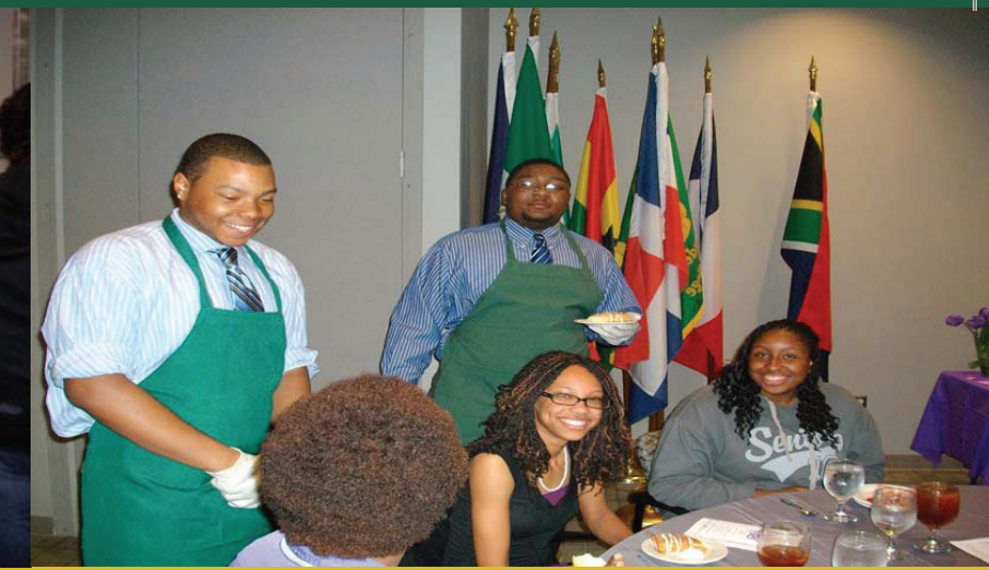
PBD Closing Dinner