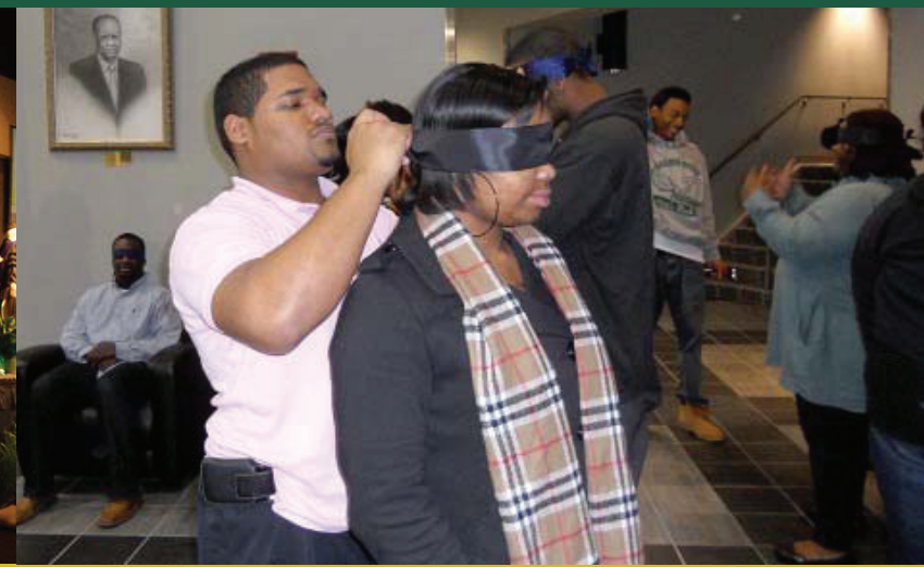
Dinner In The Dark