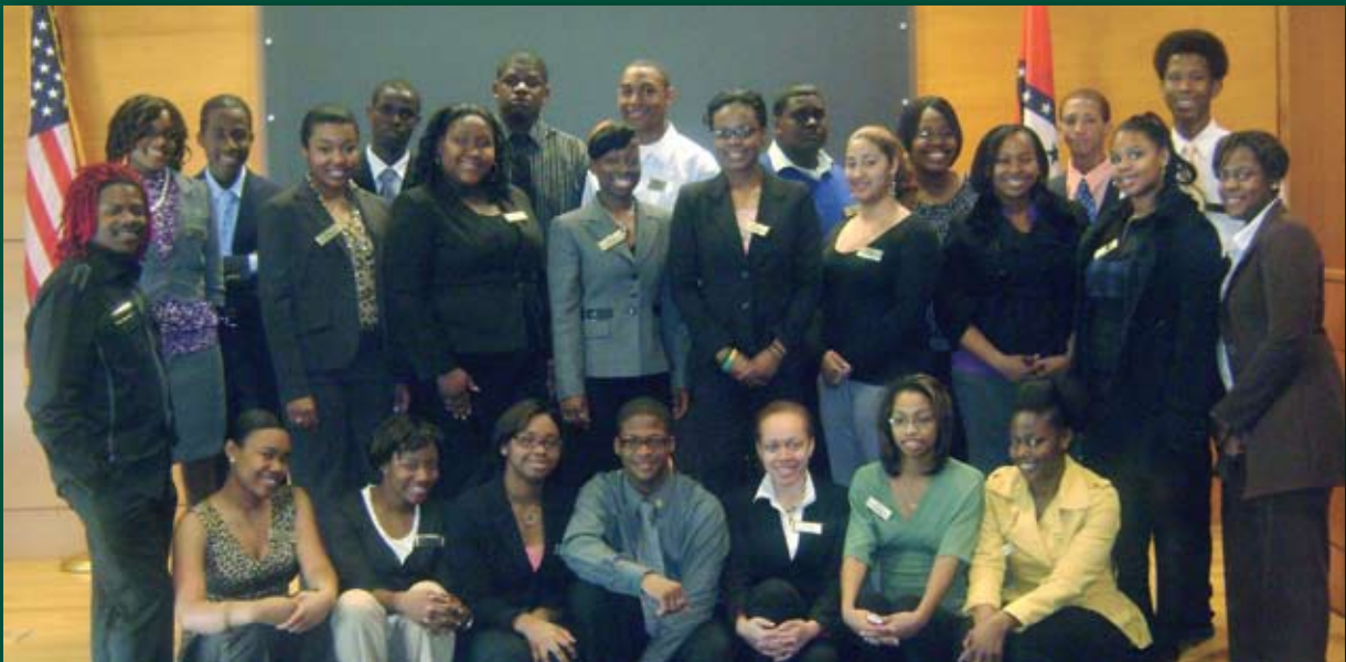
S.U.M.I.T. Leadership and Professional Development Institute Cohorts 2008-2009

PHILANDER SMITH COLLEGE NEW STUDENT ORIENTATION 2009 - 2010